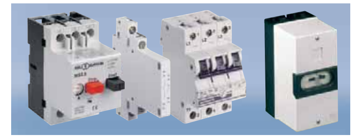
Motor protective circuit breakers from 0.1 – 40 A in 2 designs incl. extensive range of accessories