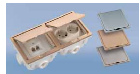
Socket outlets with metal upper section an exclusive design