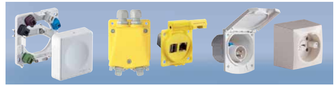
Appliance connection boxes, data sockets for Industrial Ethernet, Perilex outlets ...and many more products for electrical installations