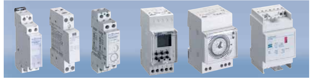
A complete, top-quality range of DIN-rail panel products

Residual current operated circuit breakers, Type A, Type B (universal current-sensitive). Residual current operated circuit breakers with overcurrent protector