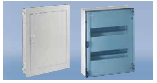
Wall- and flush-mounted distribution boxes