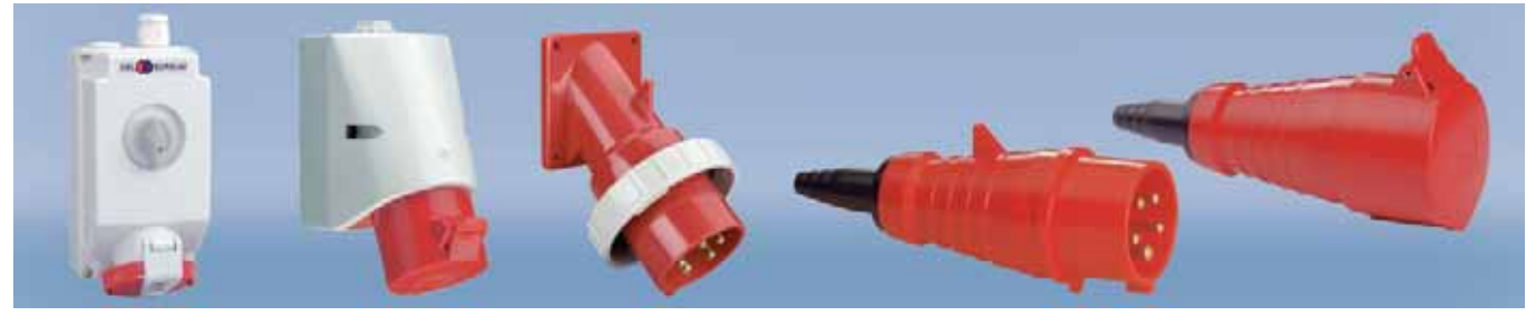
Plugs, sockets and connectors according to IEC 309 up to 125 A, a complete range in IP44 and IP67