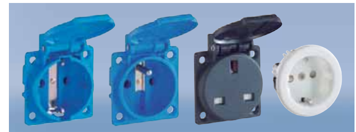
\ensuremath{\textbf{Built-in sockets}} in various designs and different national standards