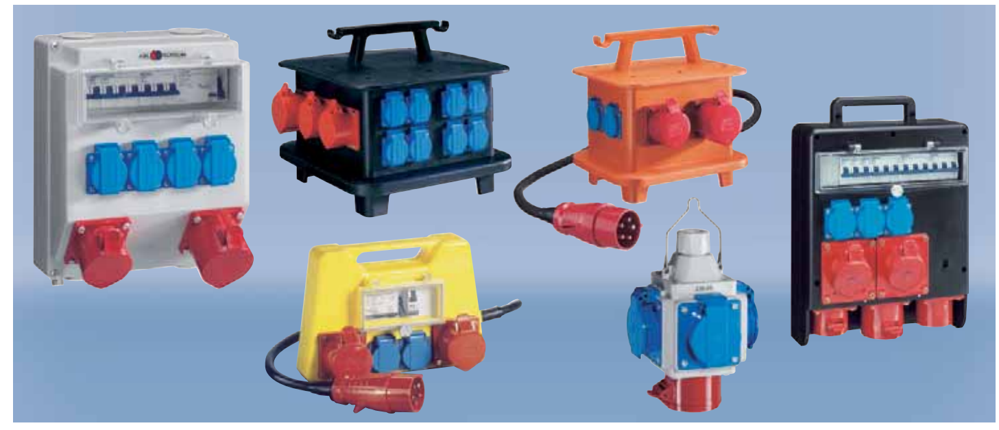
Socket outlet combination units portable and fixed, in thermoplast and rubber, according to customer's specification